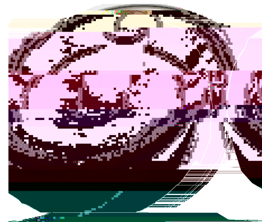
Figure 3: Initial "Tippe Top" designs

Idea Three: a "Tippe Top" -Initially not very cost effective -3 different masses -Shifted the center of mass -2 different types of material