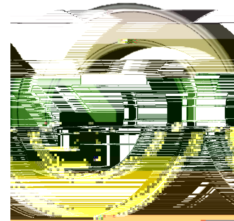
Figure 2: Spinning coin design

Idea Two: a coin that would spin and show a "Y" in the center -Not very cost efficient -Problems displaying the Y -Tried shifting the weight to different point on the circle to no avail