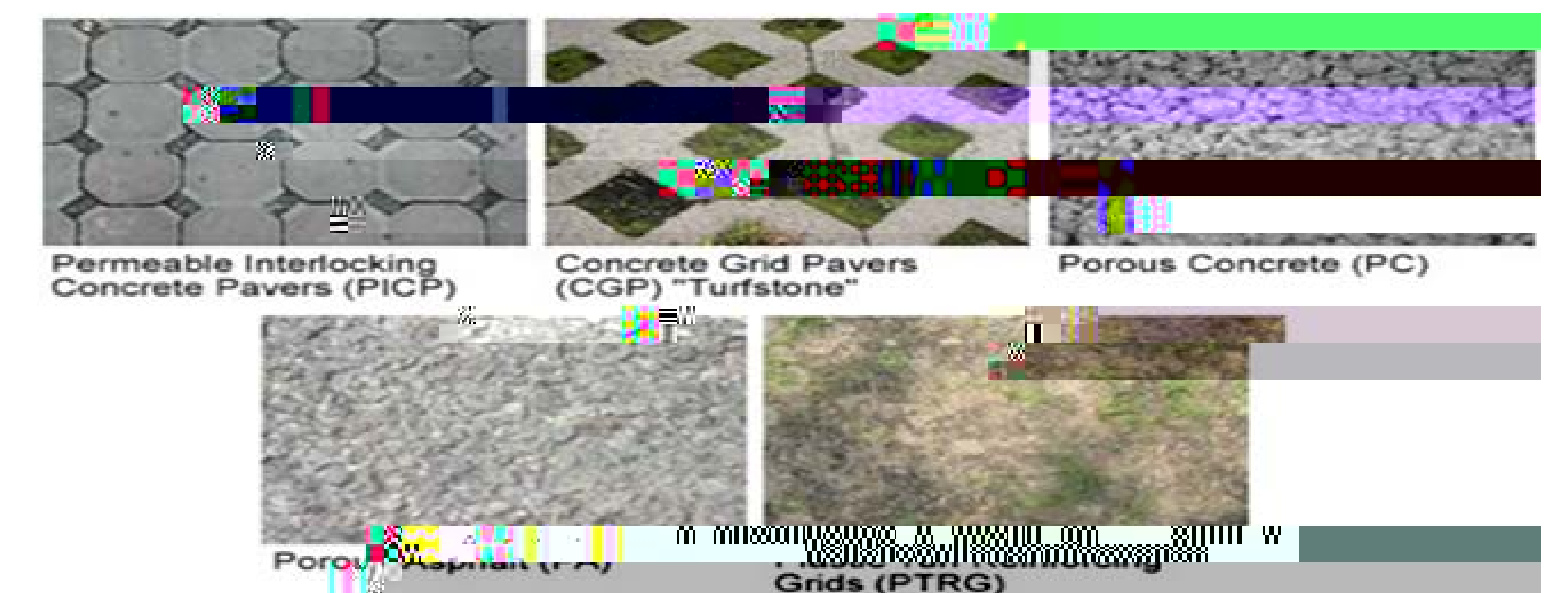
Figure 3: Examples of Permeable Pavements