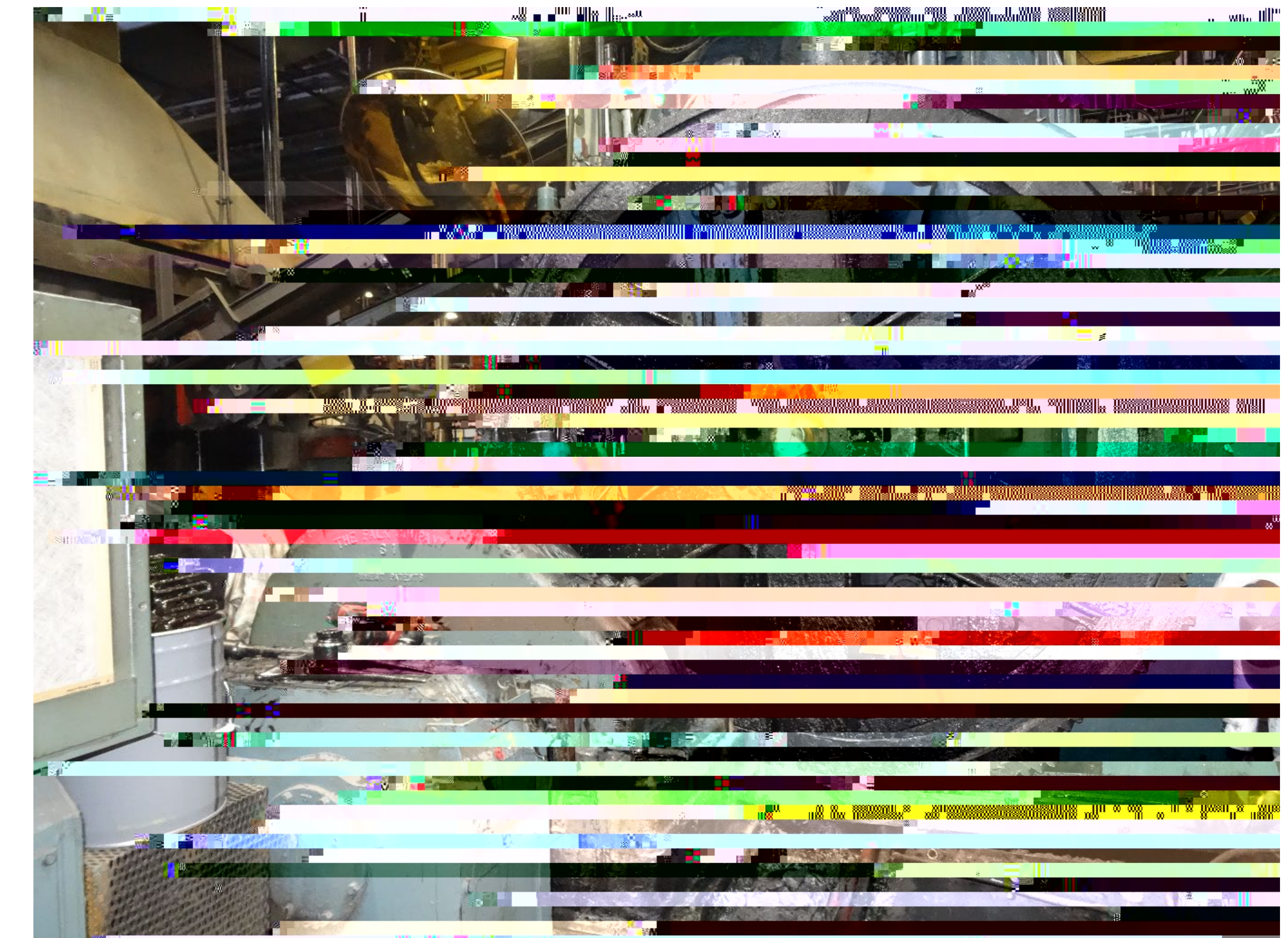
Calendar mill before work was performed