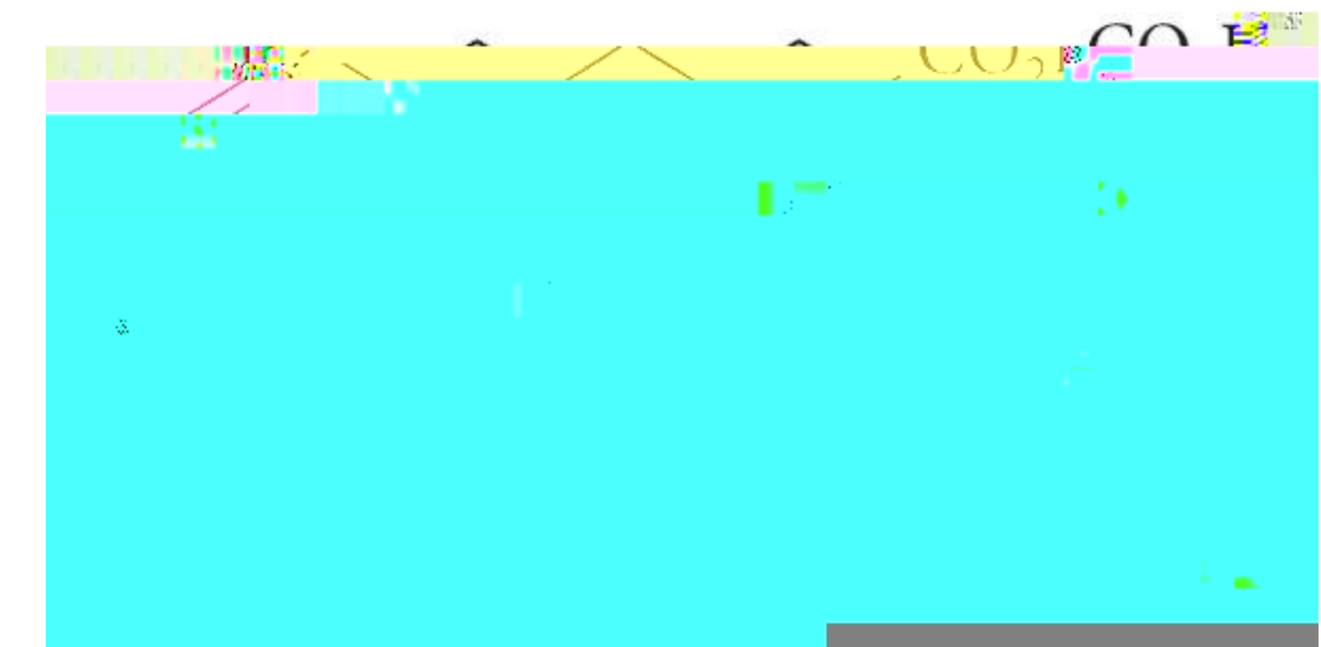
Figure 3. Levodopa chemical structure. (Abdoon, 2022)

ER-CL has a greater impact on off time and remains in the body for longer than IR-CL. The increased on time of ER-CL is linked to increased nausea compared to IR-CL. Due to these factors IR-CL seems to be the better option in early Parkinson's Disease and ER-CL for later.